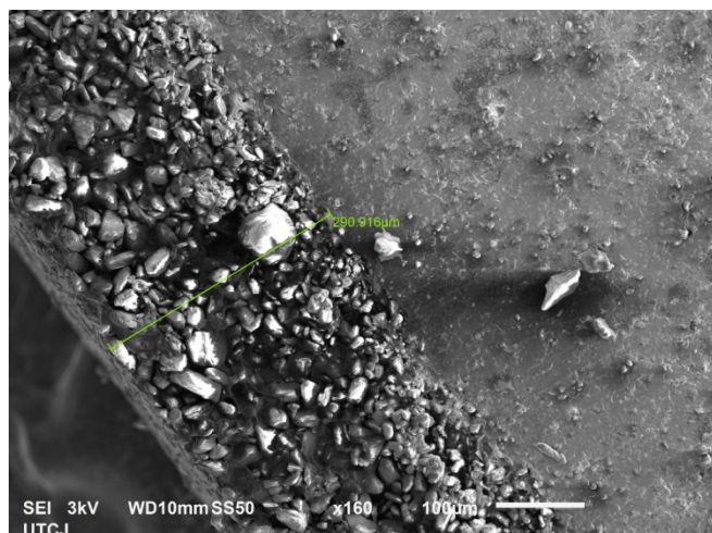
Figure 1. SEM image of transversal section of hydrogel enriched with allantoin.