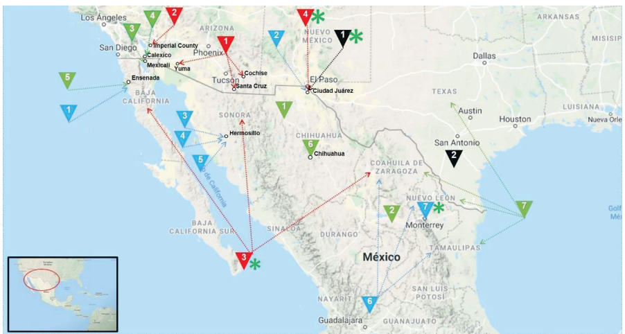
Fig. 2. Geographic representation of study areas with tick-borne pathogens at the Mexico-US border between 2003 and 2019. Legend: Color code by type of study. Green triangles and asterisk (*) indicate studies of ticks. Blue triangles, studies with blood human samples. Red triangles indicate studies with dog blood samples. Black triangles indicate studies of wild animals and horses. Maps were from Google Maps.